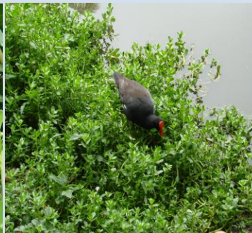
`Alae `ula or Hawaiian Moorhen