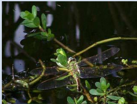
Pinao (native dragonfly)