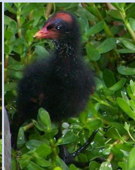
`Alae `ula chick