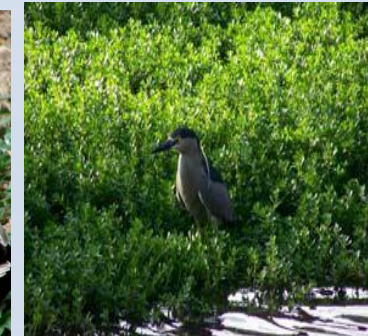
`Auku `uh (black-crowned night heron)